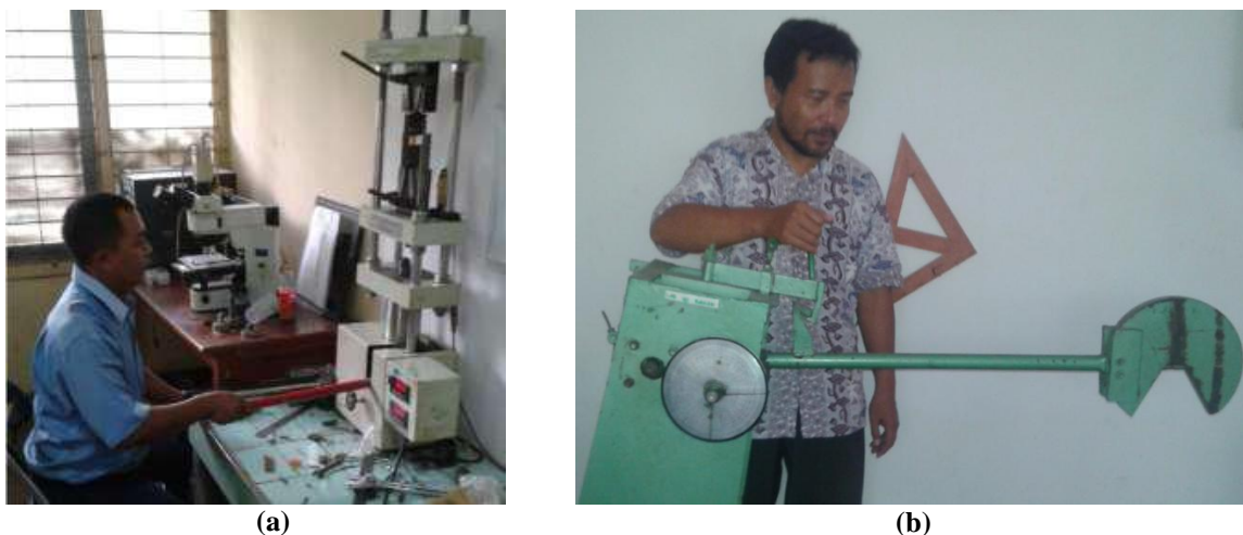
Figure 1. Test of composite cement-sugarcane particles. (a) tensile test and (b) impact test

Tensile composite test of sugar cane particles was performed using universal testing Machine and impact testing carried out with a charpy impact test machine, referring to ASTM D6110-04 standard. The spacing between the specimens is 6 times the specimen thickness. The length of the span is 96 mm.